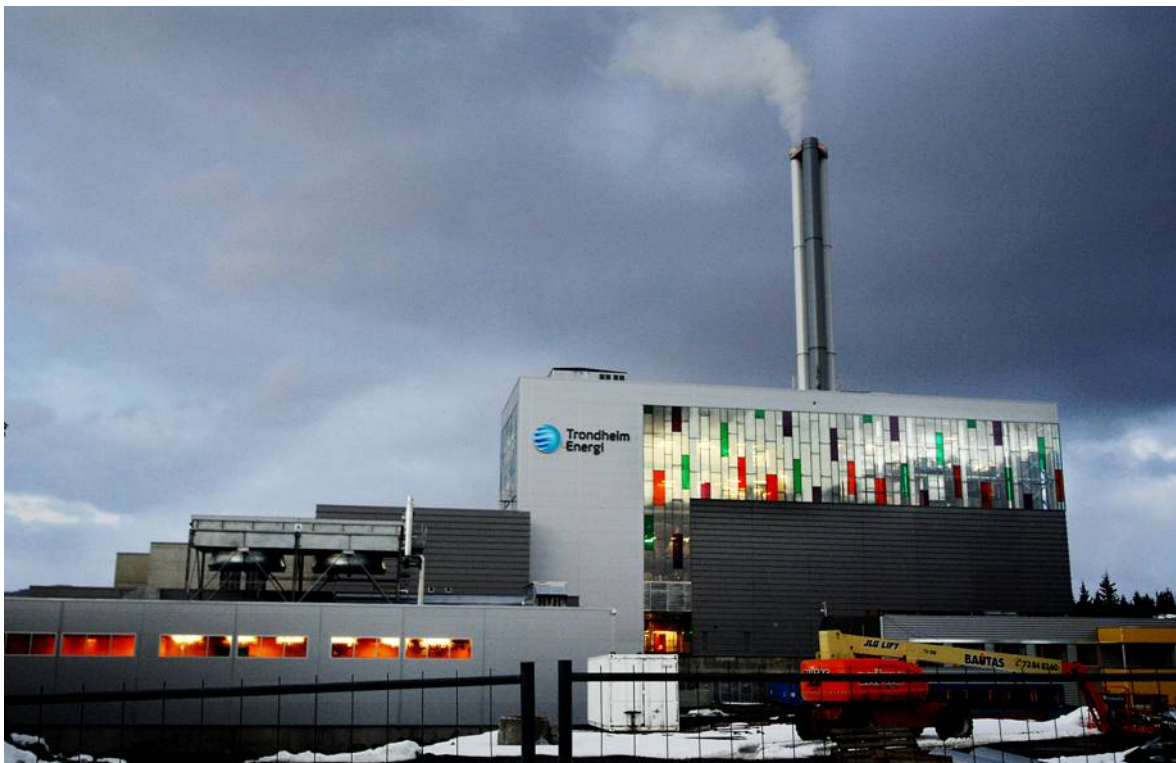
Heimdal District Heating Plant