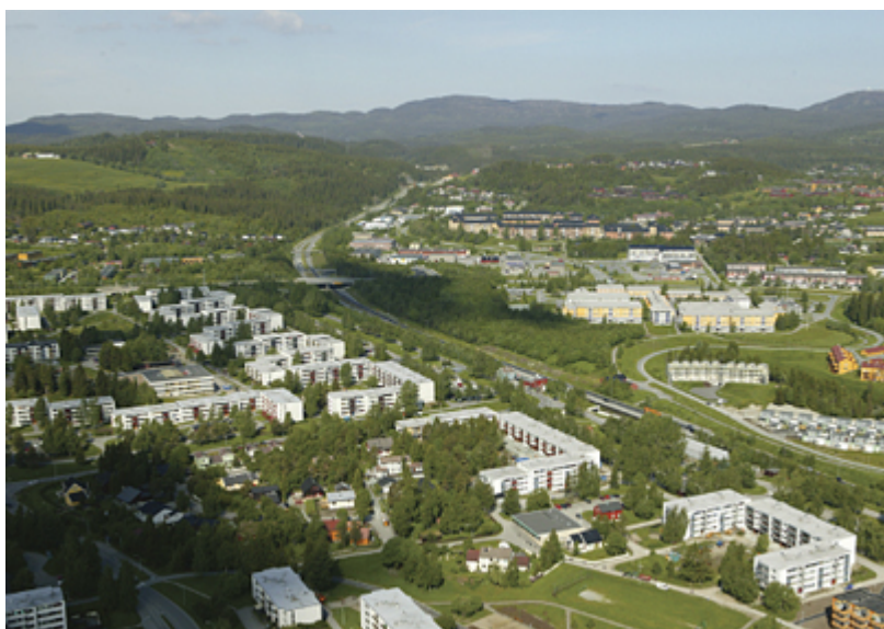
Kolstadflaten housing cooperative

Kolstadflaten housing cooperative is located south of the city of Trondheim. The housing cooperative is part of the suburb of Kolstad which is one of the city's most densely populated areas. There are 481 dwellings within the housing cooperative, which primarily consists of low-rise apartment buildings located around 6 courtyards. Each courtyard has a small children's playground. The first residents moved into apartments in 1970. The housing cooperative conducted an extensive rehabilitation between 2007 and 2008.