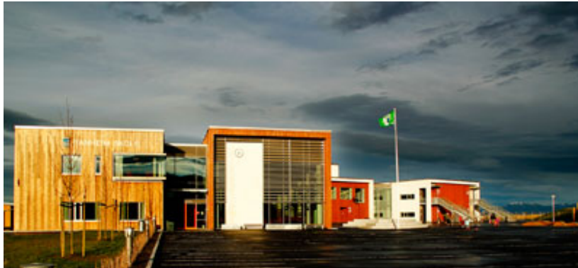
Ranheim School