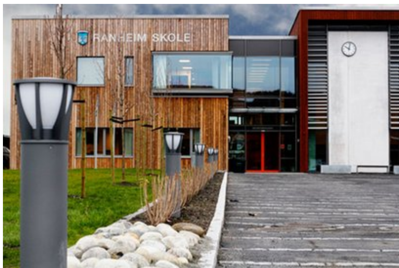
Ranheim School, Photo Trondheim Municipality

The sea water intake and heat pumps have not achieved the energy savings that were expected because the operation is so unstable.