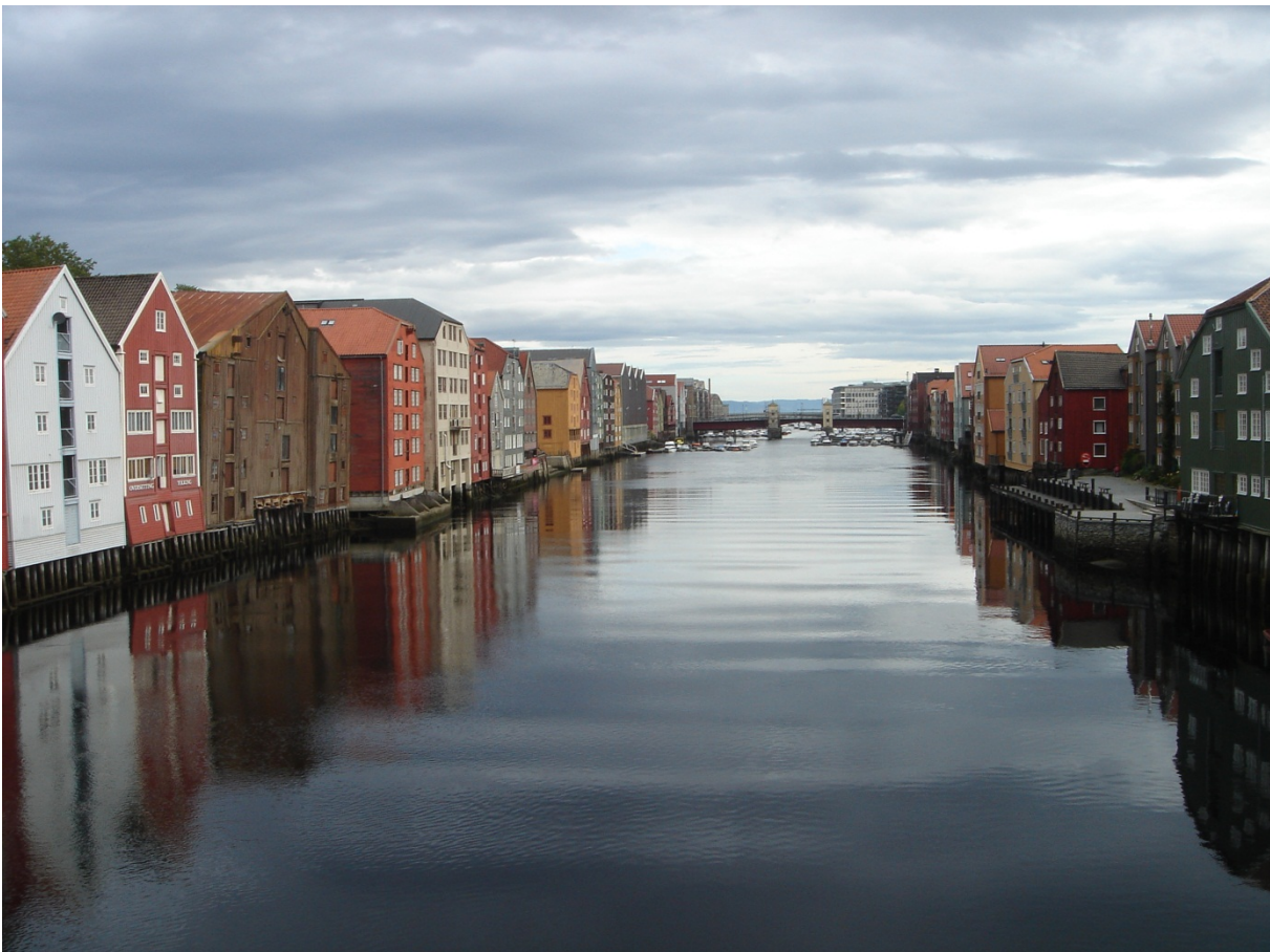
Nidelven, Trondheim 2009

In 2001 Trondheim Municipality presented its first Climate and Energy Action Plan. The action plan marks the starting point for a general increase in engagement and activity in climate and energy related issues and measures within the municipality. The ECO-City application was written in 2003, the municipality chose to participate because it was believed both on both administrative and political levels, that the project would provide a boost to the municipality's activities related to the Climate and Energy Action Plan. The timing was right for the ECO-City project. ECO-City provided financial support for the implementation of actions but this, it was suggested by the project manager, was not a primary motivation for Trondheim Municipality. The municipality was aware that that they would have to contribute considerable amounts of time and funding if the projects involved were to be successful. Participation was therefore intended to be a learning process rather than being about financial gain.