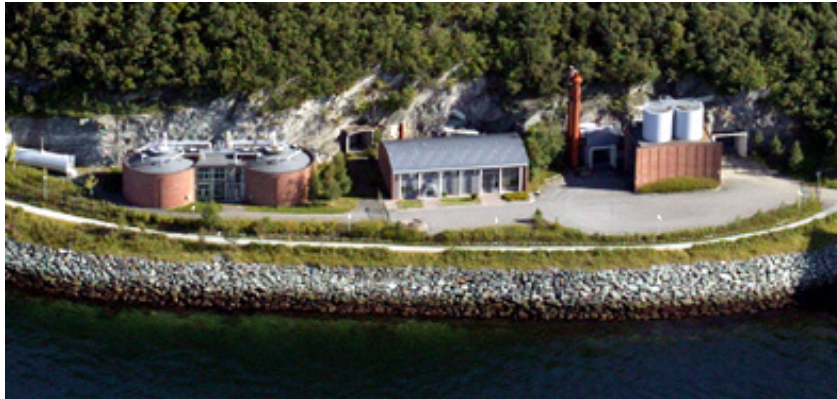
Ladehammeren Sewage Plant (illustration Trondheim Municipality)

The Ladehammeren Sewage plant is owned and run by Trondheim Municipality. It is a mechanical-chemical primary precipitation plant which purifies waste water produced by the eastern side of the city of Trondheim. The waste water comes from households and businesses, corresponding to a population equivalent of 120.000. The treated water is pumped out into the Trondheim fjord at a depth of 42 meters.