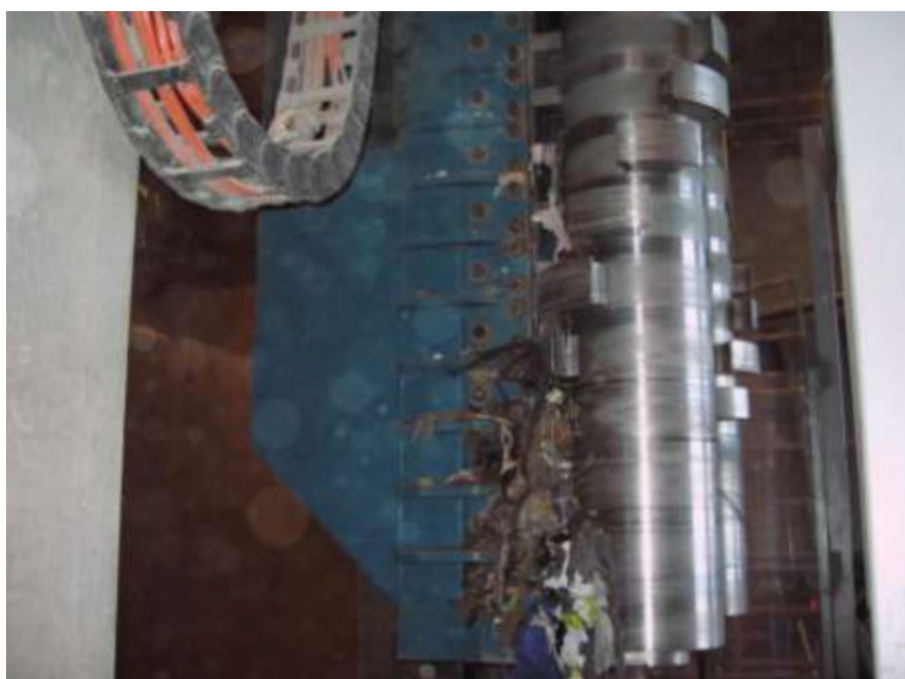
A close up of the shaft with the parts for cutting/grinding and scrapers (Illustration Statkraft Varme).

There is little similar technology already developed. Statkraft varme have had to use their own experience and knowledge, as has the supplier, Stavanger Engineering. The representative from Statkraft varme suggests that the whole process of developing the de-baling and cutting machine has been interesting (Ref. Hanssen).