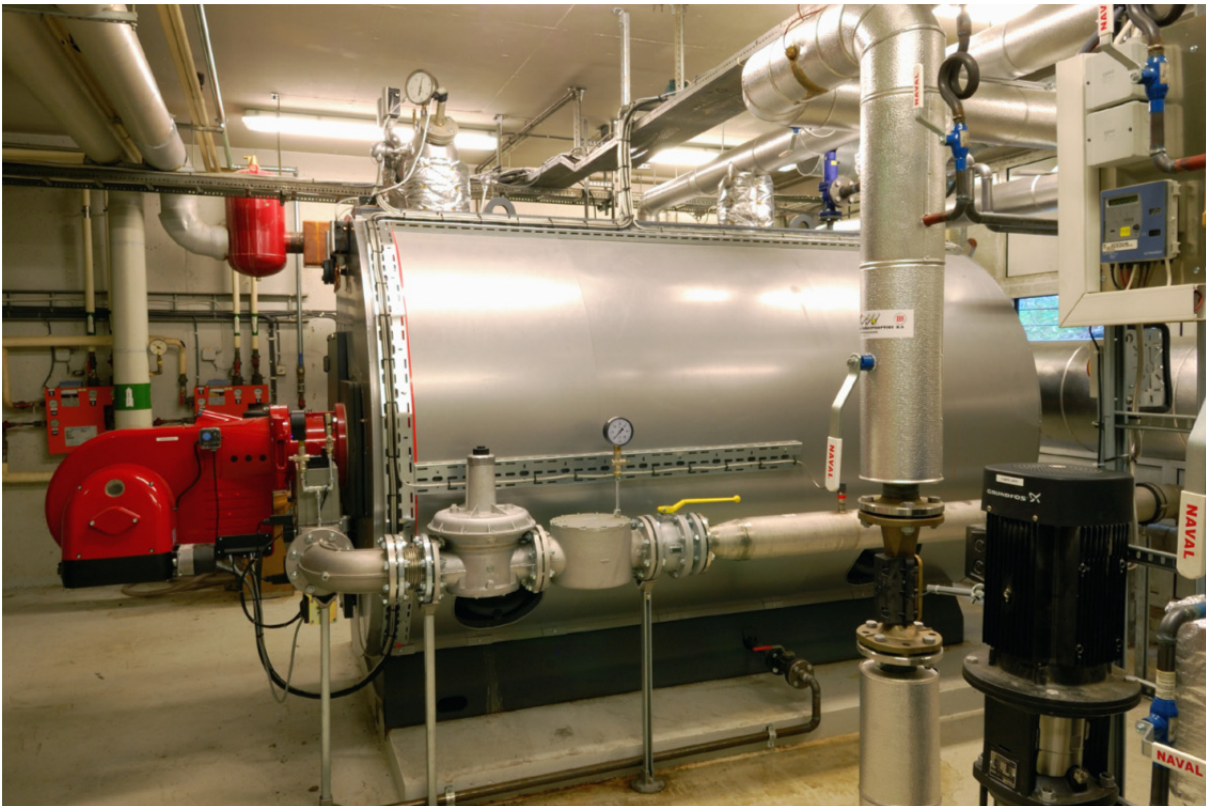
Biogas boiler (Illustration Trondheim Municipality)