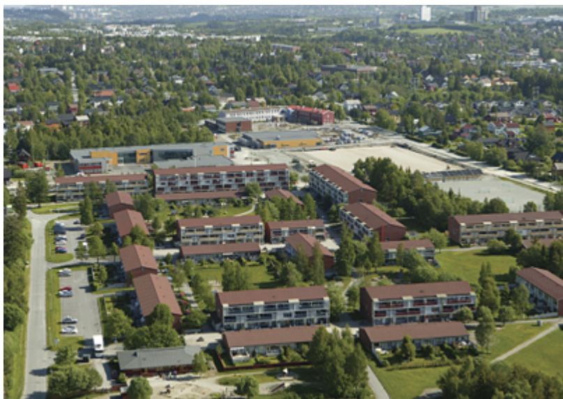
Ustmyra Housing Cooperative