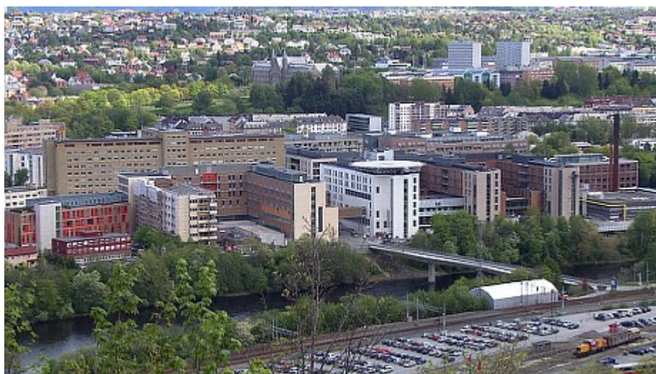
St. Olav's Hospital

St. Olav's Hospital is a university hospital and the South-Trøndelag regional hospital. The hospital is owned by the Central Norway Regional Health Authority, and is responsible for health care associated with a population of 275,000 individuals. The hospital has approximately 9600 employees. St. Olav's was officially opened in June 2010, but the entire hospital building project will be completed in 2015. The new hospital when it is completed will have a total area of 197,500 m 2 . St. Olav's hospital requires a large and effective cooling system.