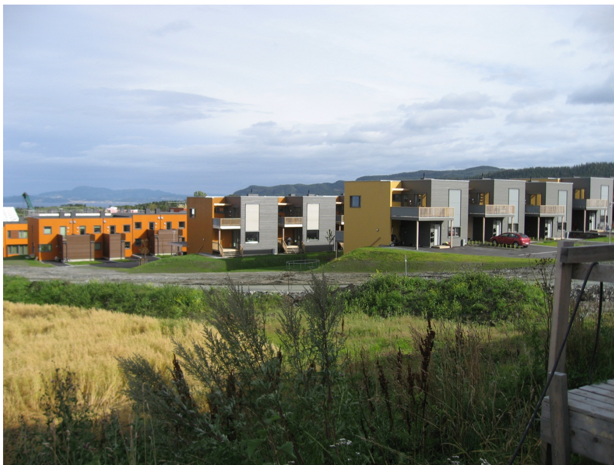
Miljøbyen Granåsen, September 2012