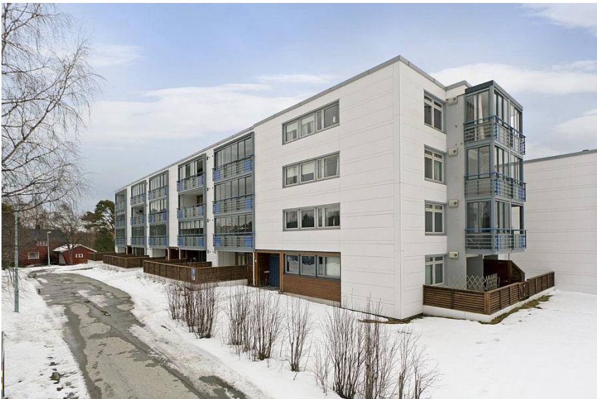
Kolstadflaten housing cooperative