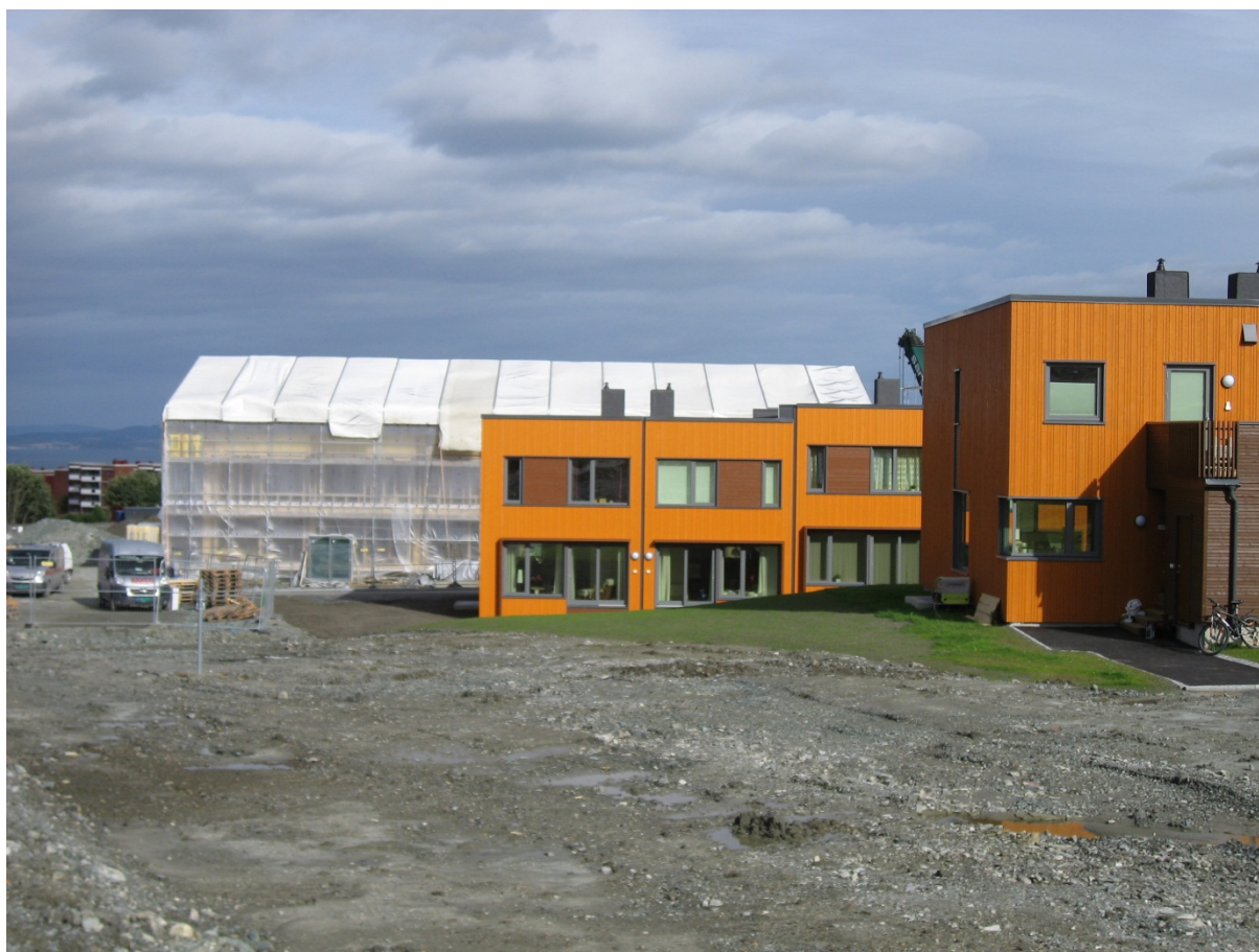
Miljøbyen Granås, September 2011