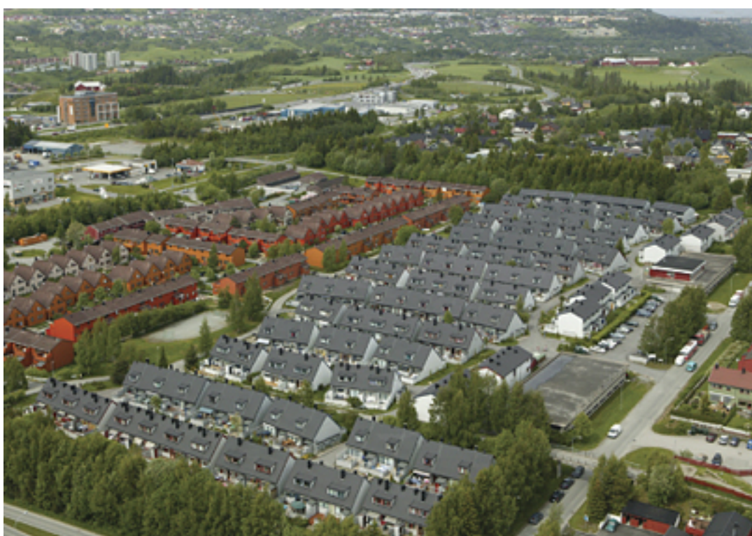
Tonstad BRL, photo TOBB

Tonstad Housing Cooperative includes 144 row-houses and four-family homes. The first residents moved in June 1979. The architects were Visavis arkitektkontor/staden bygg. The housing cooperative is part of the Tiller neighbourhood which lies on the southern side of Trondheim.