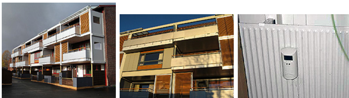
Ustmyra housing Cooperative

The visions and intentions for the project were formulated by: COWI (energy guidance), TOBB, and the housing cooperation's board of residents. The motivation for the project was to save energy, but the project was started because there was a general need for building upgrading (renovation of facades, general face-lift within the cooperative) which also actualised ambitions in relation to saving energy (Löfström, 2012). The target was set at saving 40% (30% technical solutions, 10% resident awareness and diminished energy use). The outdoor facades and ceilings which are in contact with the loft have been re-insulated (15cm). In addition the apartment buildings have replaced windows and introduced individual measurement of supplies from the district heating system. Residents instead of receiving a common bill and individual payment based on areal use, now are billed based on actual consumption.