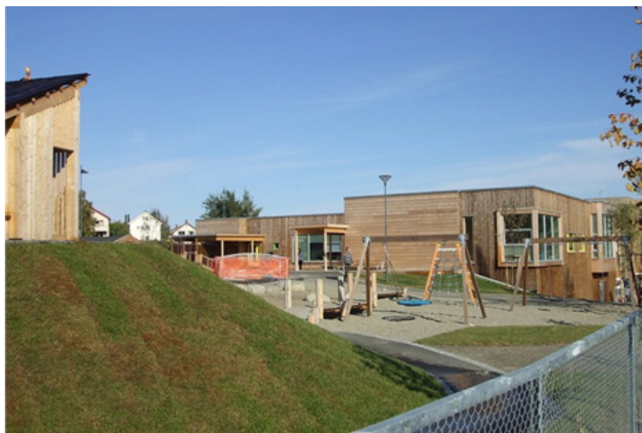
Nardo School, Photo Eggen arkitekter