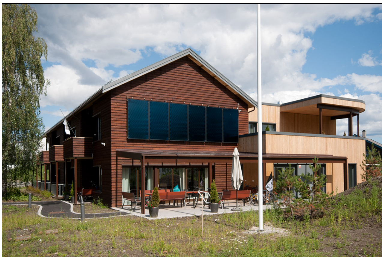
Ranheimsveien 149, photo Pr ndeimr

There have been no technical problems with the solar collectors; according to the project management they just do not produce very much energy. However, it is suggested by the project management that, there is no reason to remove them now that they have been installed. They can simply carry on producing what they are capable of producing (Ref. Lindtorp).