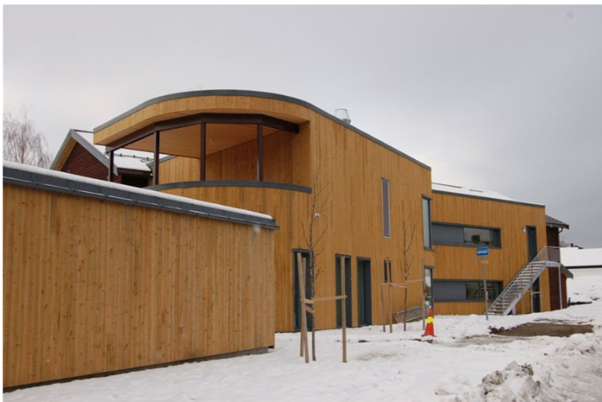
Ranheimsveien 149