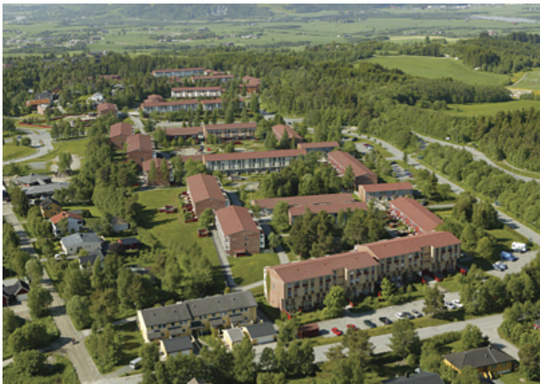
Torvsletta BRL