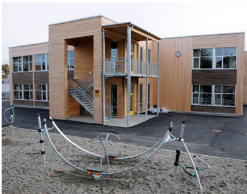
Nardo School, photo Trondheim Property Management (Trondheim eiendom)

Nardo School uses very little electricity. It has the lowest electricity use of all the schools in the municipality (Ref. Tømmervik). The school is an important municipal pilot project. When it was built the school building cost more than similar building projects, but the gains have out-weighed the costs (Ref. Lundli). The municipality has been able to test solutions which have been used in other municipal buildings. The school is air-tight, and requires a good ventilation and cooling system. More traditional solutions which only include heat pumps would not have been enough. Initially it was a challenge to gain financial approval for the project (Ref. Lipphardt). The grant from the EU helped to get the project started. Nardo School was for a number of years the most energy efficient school in Norway, and it has been useful in helping to market Trondheim's climate and energy policy outside the city. It also helped the project managers argue successfully for the inclusion of similar measures in the schools and municipal buildings that were built afterwards.