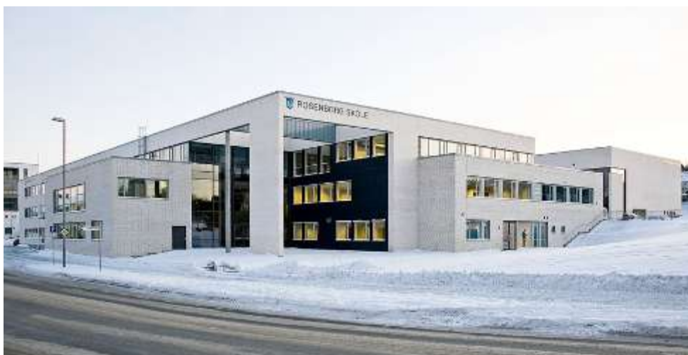
Rosenborg School

The new Rosenberg School and sports hall opened in 2009. It is built on the site of the old school which was demolished in 2008. The school and sports buildings were designed by HUS architects. It is a middle school with 440 pupils and a staff of approximately 50 people. There is only 30 to 40 meters between the sports hall and the school, and they both have the same technical installations. The school building is 7560 m 2 ; of this 6900 m 2 is heated. The sports hall is 2849 m 2 and 2724 m 2 is heated.