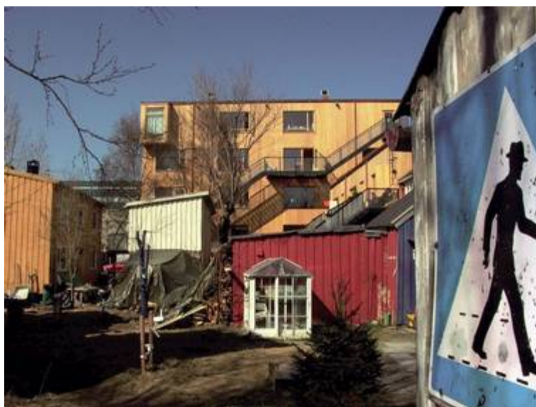
Svartlamoen 2011

Svartlamoen in Trondheim is Norway's first urban ecological neighbourhood. Svartlamoen housing foundation has the formal responsibility for managing and maintaining rental properties in Svartlamoen. The Svartlamoen housing foundation was established by the Trondheim municipality in 2001. Along with Svartlamoen cultural and economic foundation, the housing foundation runs Svartlamoen as ecological neighbourhood according to the municipality's definition, which says that Svartlamoen should be an alternative neighbourhood with room for experimentation. This applies to the housing, social interaction, participation, ecology and energy use, municipal services, art, culture and economic development.