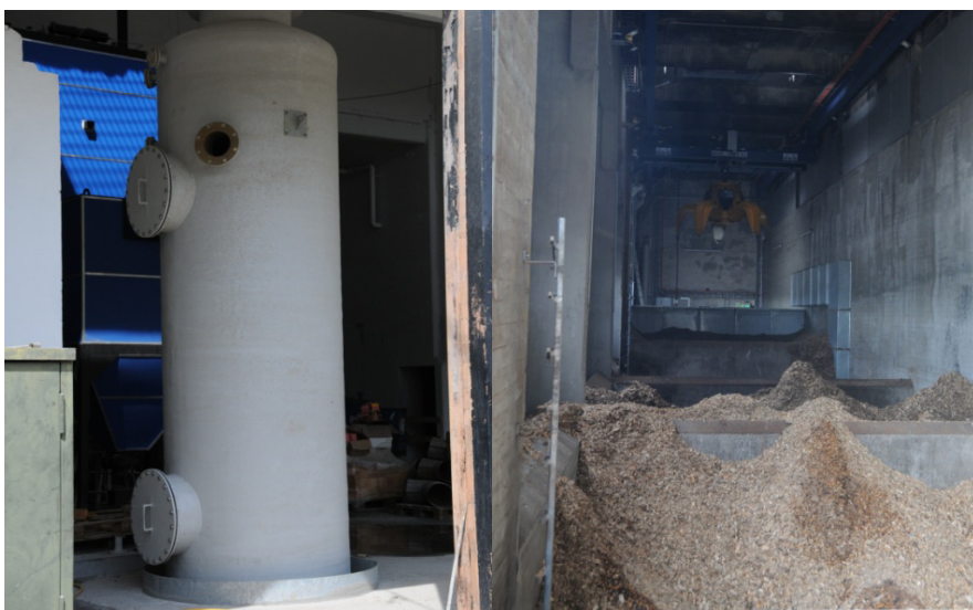
To the right: The smoke washer and the woodchip store